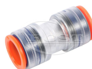
Micro Duct Connector