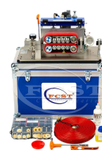
Fiber Blowing Machines