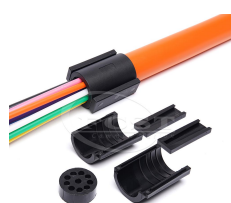
Divisible Duct Sealing-40~63mm(HT)