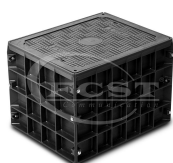
Telecom Manhole Chamber